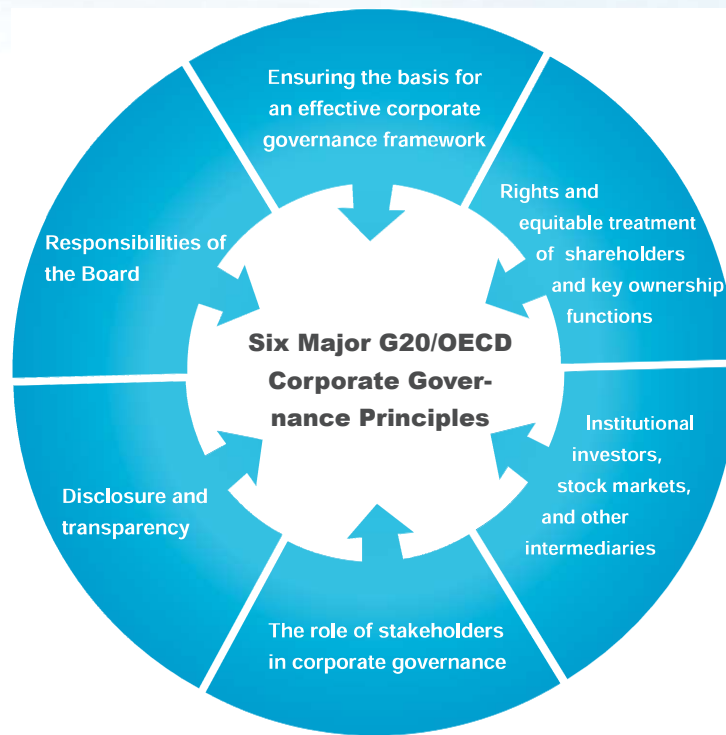
Figure 2.1 OECD Corporate Governance Principles